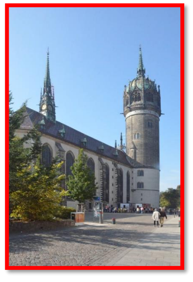
Castle Church – Wittenberg