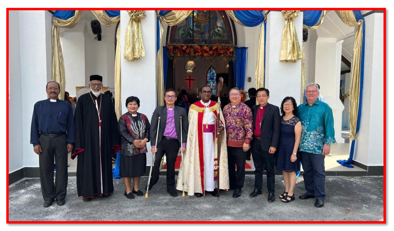
Anniversary of the Zion (ELCM) Congregation (30<sup>th</sup> November 2024)