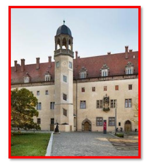
Luther's House in Wittenberg